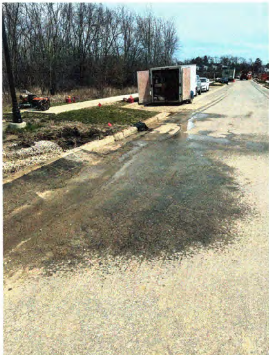
After the truck in Exhibit E drove away.